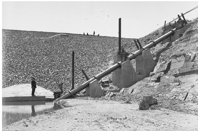
Pekina Creek Dam 1907